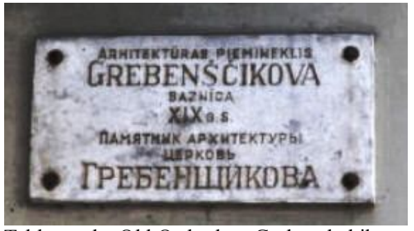
Table on the Old Orthodox, Grebenshchikova Church in Riga, built in XIX, monument of architecture is protected by the state