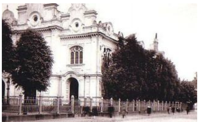
Great Choral Synagogue was in Riga, built in 1871, in 1941 fathoms. (Old Photography).