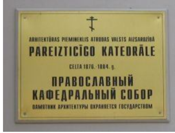
Table on the Orthodox Cathedral in Riga, built in 1884, monument of architecture is protected by the state.