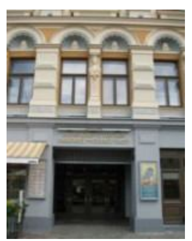
The central entrance to the Russian Theatre in Riga.