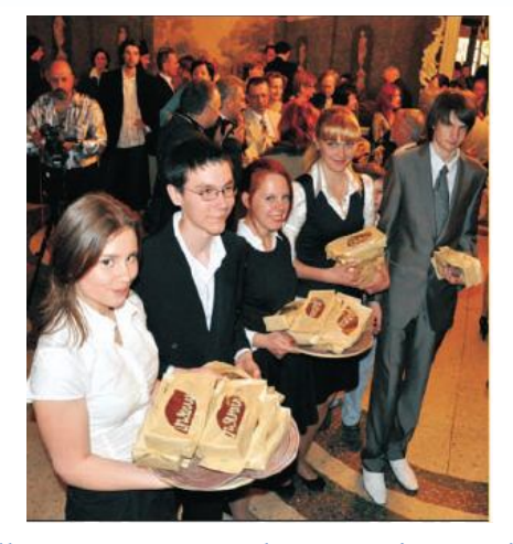
All guests were treated to a Russian-Latvian gingerbread specially baked for the holiday

In 2011, within the framework of the restored Days of Russian Culture in Latvia, 73 events were held, which took place in Riga, Daugavpils, Rezekne, Jurmala, Jaunolain, Jelgava, Wilani. These were performances, concerts, presentations of new books and almanacs, a large-scale family holiday was organized in the Verman Garden.