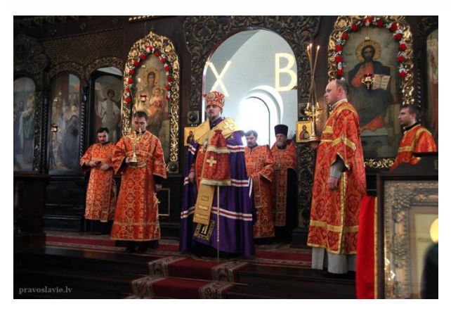
Liturgy in Day St. Cyril and Methodius, Daugavpils, 2013.