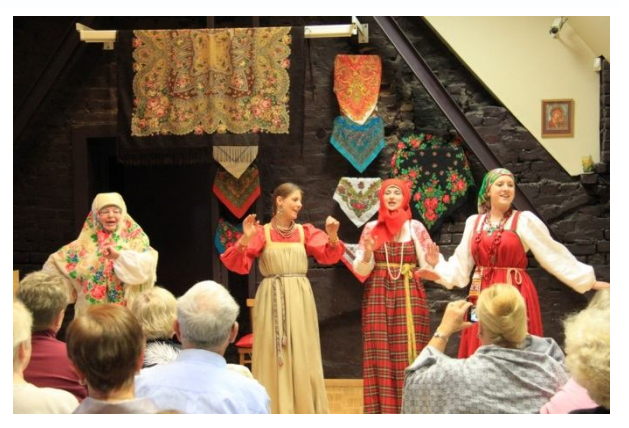
Performance of the amateur collective, 2011.