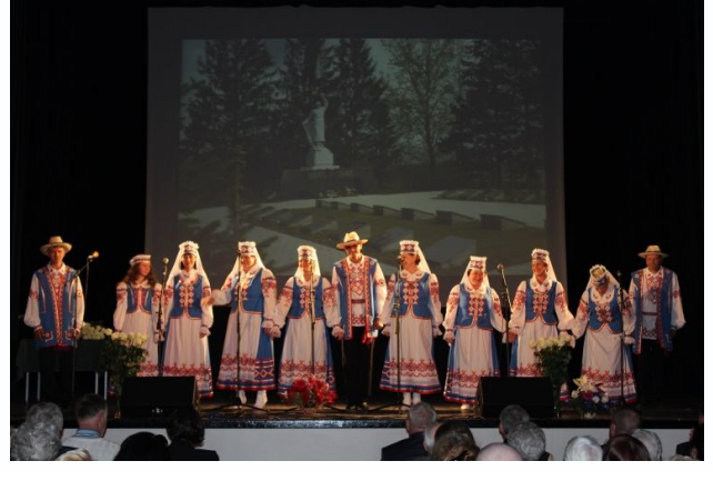
Russian Folk Song Choir, Liepaja, 2015