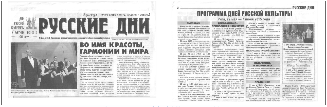
The newspaper of the jubilee DRKL 2015.