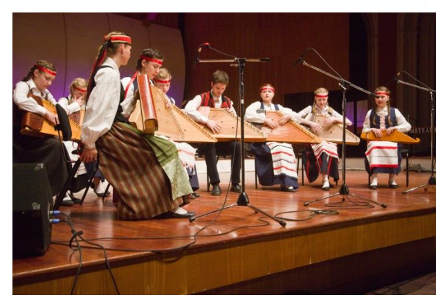
Participants of the Festival "Riga Gingerbread", Riga, 2015