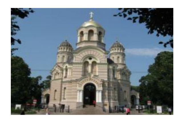
Riga Orthodox Cathedral (modern photo)