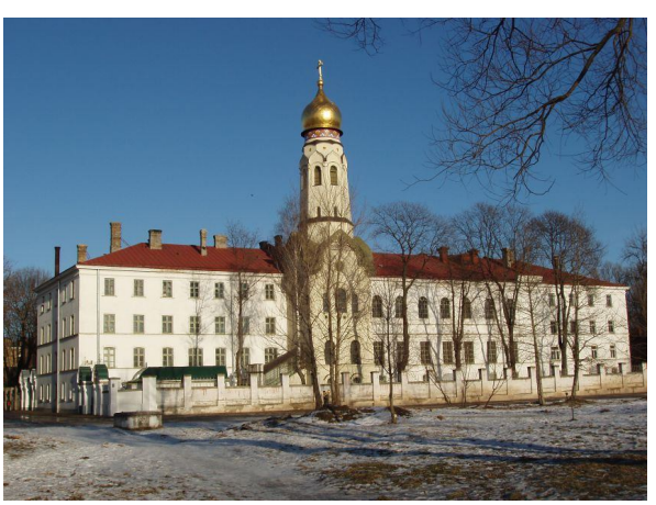
The largest in the world Old Orthodox Church (Grebenshchikova) in Riga, built in 1814