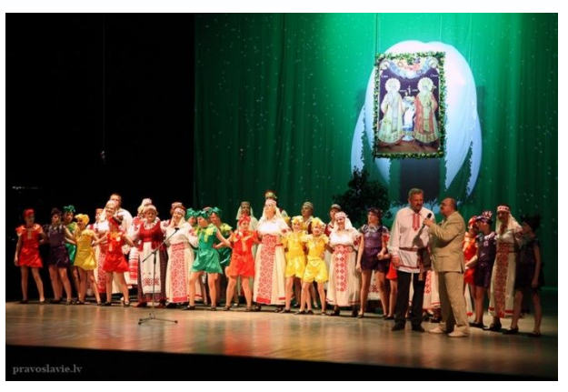
Participants of the concert dedicated to the Day of Slavic Writing, Daugavpils, 2013.