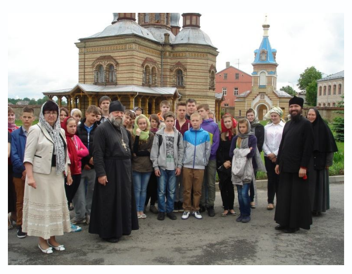
The meeting of the students of the 2nd secondary school of Jekabpils with the clergy of the Holy - Spirit men's Monastery, Jekabpils, 2013