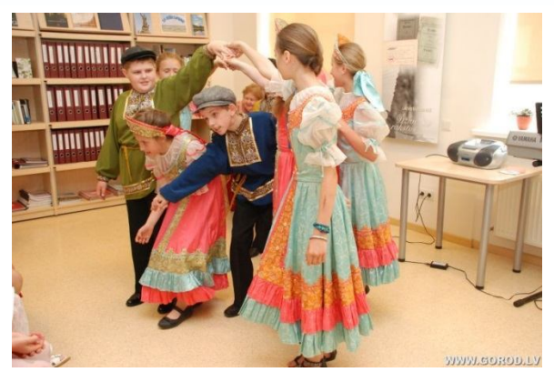
Children's dance group, Daugavpils, 2012