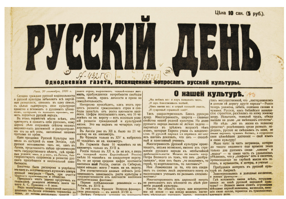
Special newspaper "Russian Day". Riga, September 20, 1925.

In addition, a special newspaper, Russian Day, was released in that day, which subsequently became annual. The famous newspaper "Today" in that day was filled with articles talking about various Russian writers and scientists.