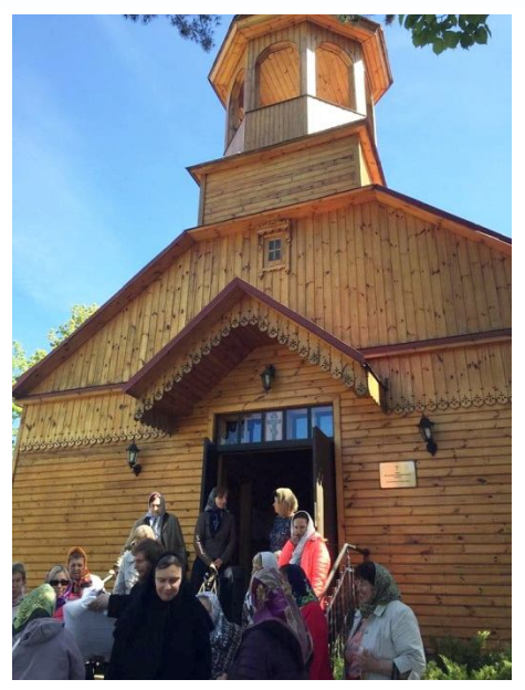
Excursion of the temples of Old Believers, Rezekne, 2017