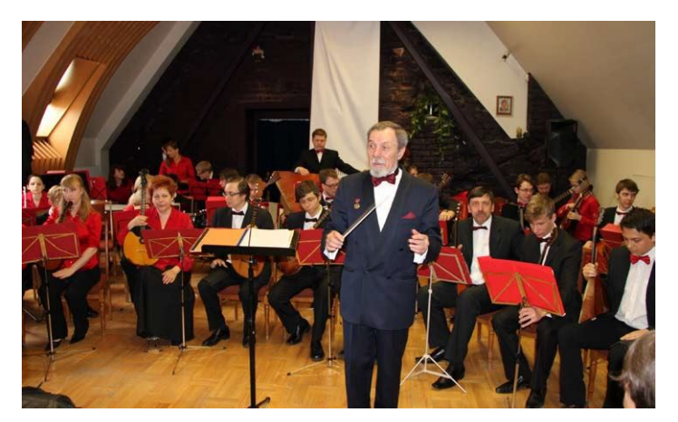
Performance of the orchestra of Russian folk instruments "Slavs" led by Victor Zhilyaev