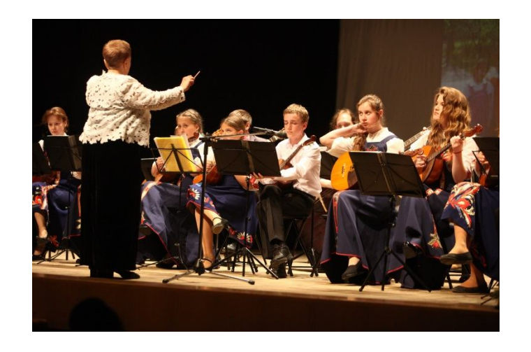
Orchestra of Russian folk instruments "Kadans", 2014