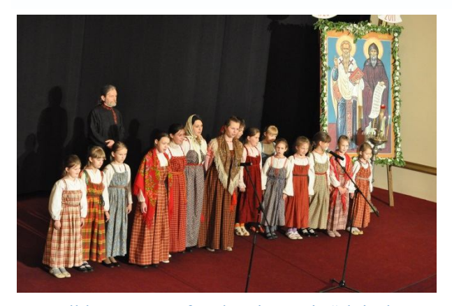
Folklore group of authentic music "Ilyinsky Friday", 2011