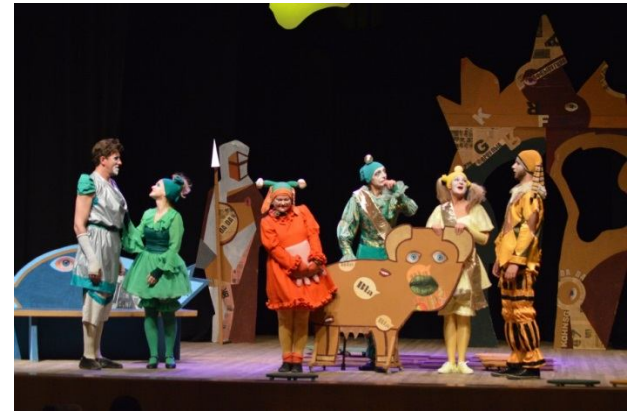
Tours of the City Theater "Yorik" from Rezekne in Riga