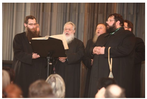
Choir Old Believer "Unison", performing Old Russian liturgical singing (singing on signs - on banners) ,2014