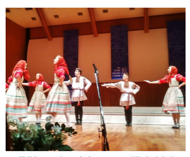
Children and youth dance group "Zadorinka" in Riga 2019