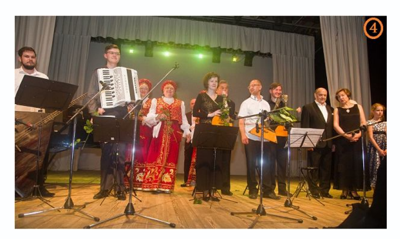
Closing of the Days of Russian Culture in Latvia on June 6, 2017