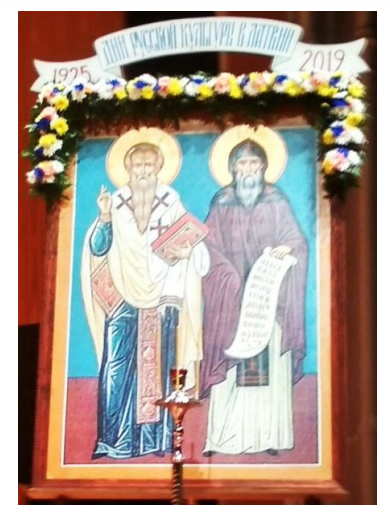
Icon of St. Cyril and Methodius