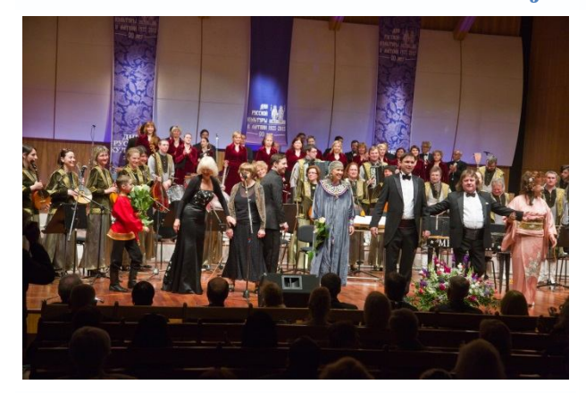
The opening ceremony of the jubilee DRCL in 2015.