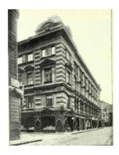
The building of the Society "Russian Hive", Kalkyu Street (old photo).

On this day, several events were held at once in the Society "Russian Hive" building (today the M. Chekhov Russian Theater).