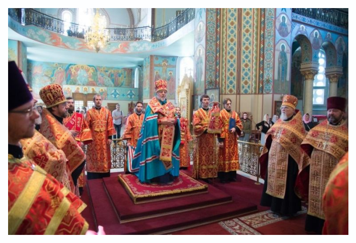
Liturgy in honor of St. Cyril and Methodius in the Riga Cathedral of the Nativity of Christ