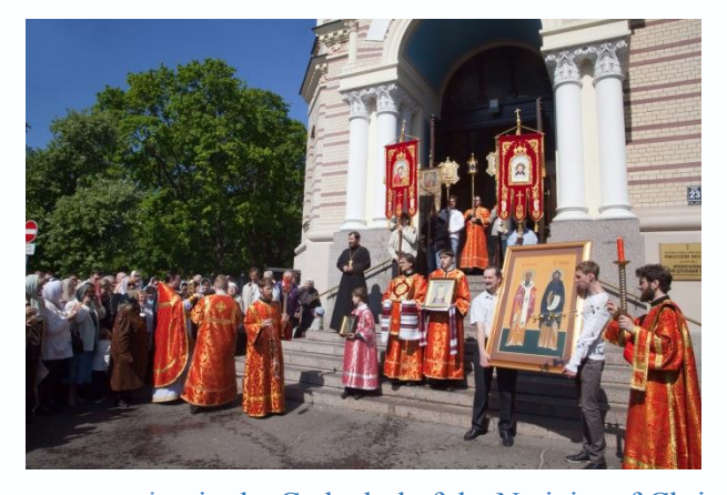
Religious procession in the Cathedral of the Nativity of Christ, 2011

In 2011, within the framework of the restored Days of Russian Culture in Latvia, 73 events were held, which took place in Riga, Daugavpils, Rezekne, Jurmala, Jaunolain, Jelgava, Wilani. These were performances, concerts, presentations of new books and almanacs, a large-scale family holiday was organized in the Verman Garden.