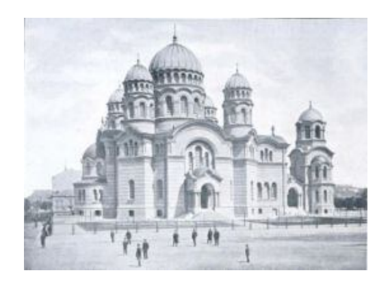
Riga Orthodox Cathedral built in 1884. (old photo)

The tradition "Days of Russian Culture in Latvia" (DRC) is the largest, very meaning for the Russianlanguage indigenous people of Latvia annual, mass event of the intangible cultural heritage. The first such holiday took place on September 20, 1925. Celebrations began in Riga, in the Cathedral, at 9 a.m.