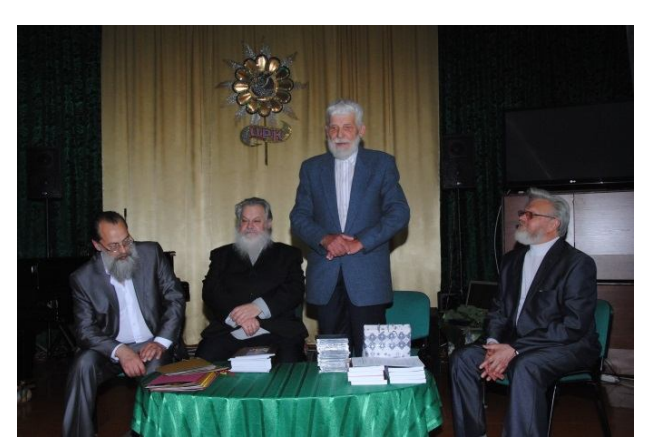
Competition of Research jobs on Old Belief in Latvia, Daugavpils, 2012