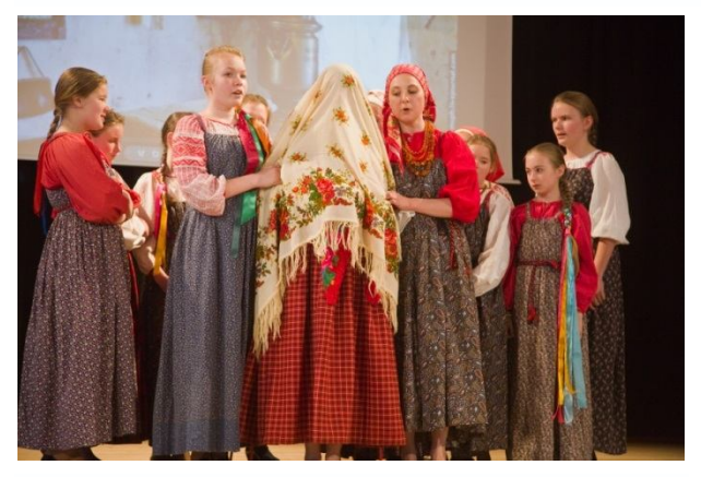
Performance of the Russian folklore group "Ilyinsky Friday"