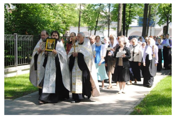
Religious procession on Slavic Writing Day, May 24, 2012, Daugavpils