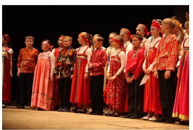
Performance of the children's dance group, Riga, 2014