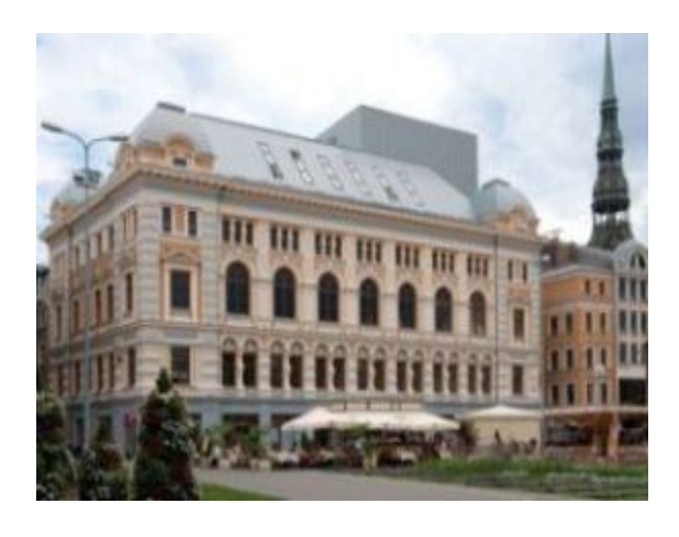
Now it this houses is the Riga Russian Theater, founded in 1883. (modern photo)