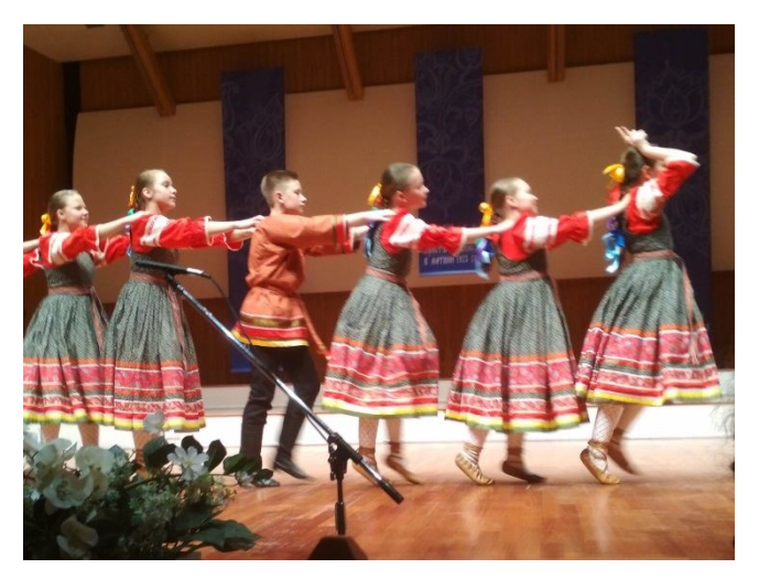
Children and youth dance group "Zadorinka" in Riga 2019