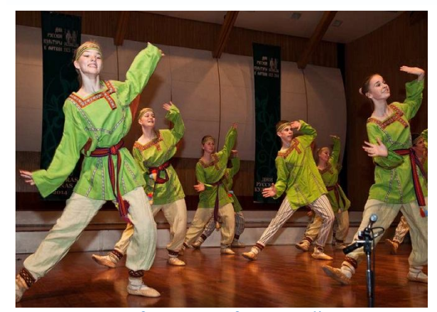
Performance of step studio Riga, 2014