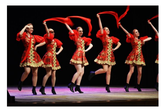
Concert of the creative dance group "LiK", 2018